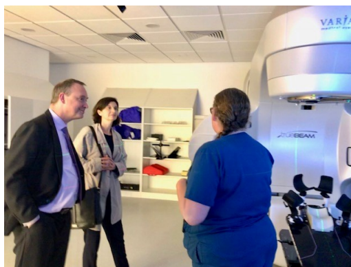
To the left the tour of Guys Cancer Centre at QMH